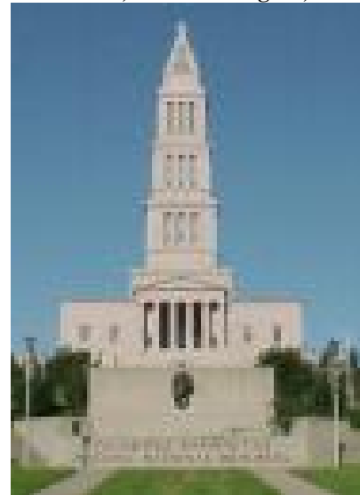
George Washington Masonic National Memorial Old Town Alexandria

Non Profit Organization U.S. Postage PAID Fairfax, VA Permit #6488